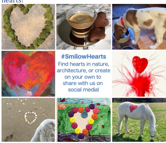
Read More >>

All heart photos submitted will be used in a future art installation project in the main lobby of Smilow Cancer Hospital. You can also email your photos to dana.brewer@ynhh.org We look forward to seeing your boots!