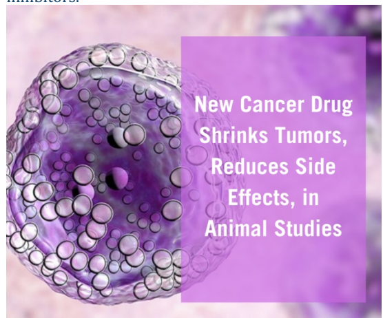
Read More >>

In animal studies, the Yale researchers examined the impact of the new inhibitor, called NHWD-870, on ovarian cancer, small cell lung cancer, breast cancer, lymphoma, and melanoma. They found it was between 3 times and 50 times more potent against cancer cells than existing BET inhibitors.