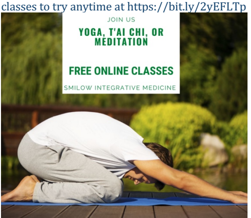
Read More >>

Our Integrative Medicine Program continues to provide opportunities to help with your well-being. Please check our calendar for live online classes each week at www.yalecancercenter.org/calendar and access archived