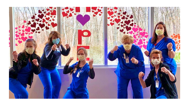
A Window Morphs into a Rainbow of Hope at the Smilow Cancer Hospital Care Center in Waterford